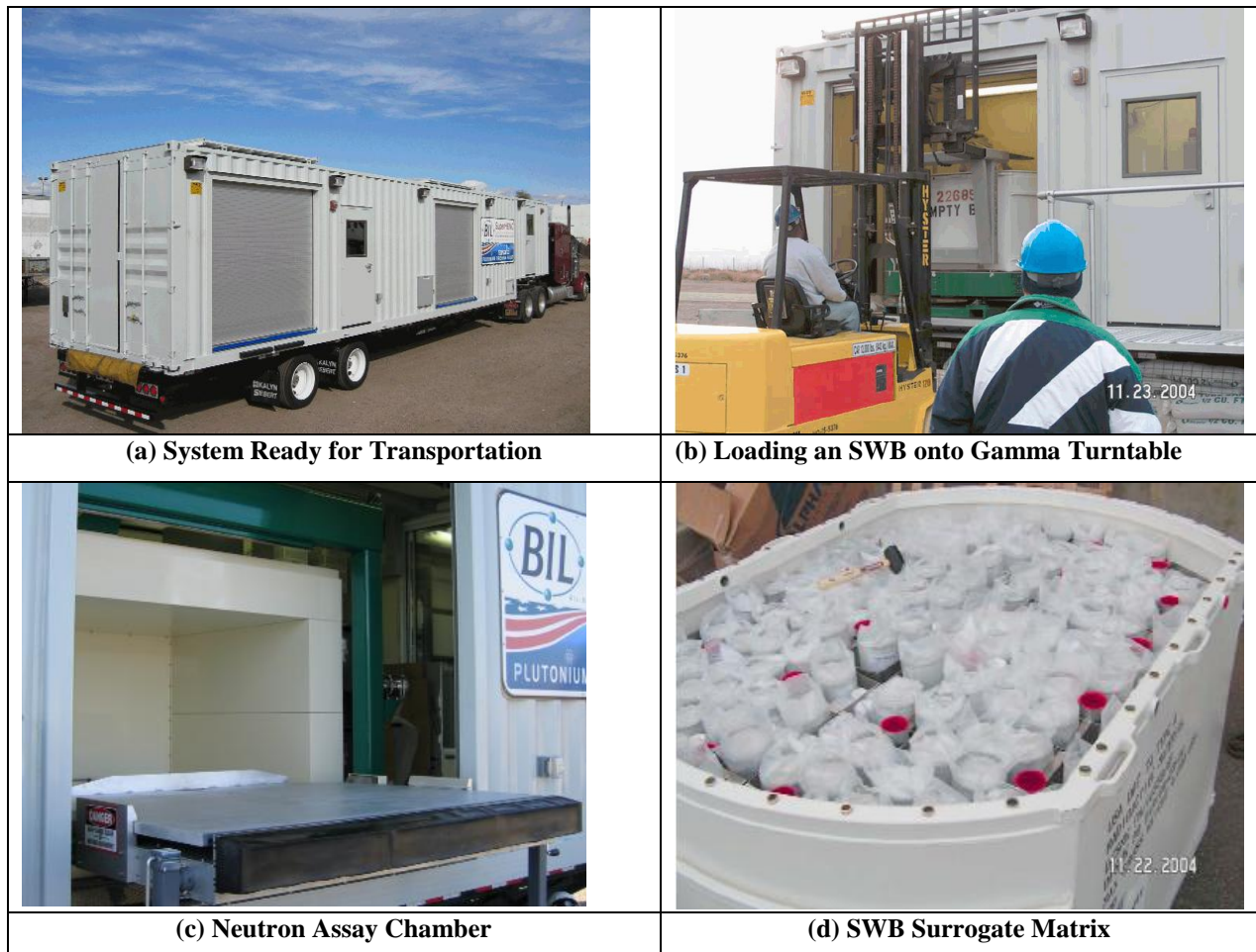
Fig. 1. Hanford SuperHENC system

The calibration program of the WRAP SuperHENC consisted of extensive calibration measurements, calibration confirmation measurements with various matrices and Pu gram loadings, and Total Measurement Uncertainty (TMU) and Lower Limit of Detections (LLD) measurements. The calibration program which started in November 2004 was completed in March 2005. The calibration covered a range of LLD to 650 grams of WGPu. The LLD and consequently the MDC are functions of the net matrix weight. The WRAP SuperHENC went through initial WIPP Certification Audit and WIPP Performance Demonstration Program (PDP) and started assaying waste in June 2005.